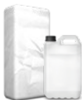
Waterproofing Generic two-component

1 ST STEP: WATERPROOFING + 2 ND STEP: TILING